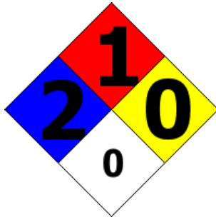
NFPA SCALE (0-4)